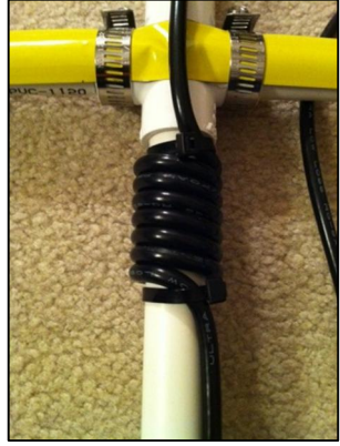
Balun detail The balun goes on the handle, just below the reflector.