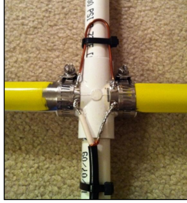
Hairpin match and solder connection detail

Tune the antenna by loosening the hose clamps and sliding the driven elements in or out a few millimeters.